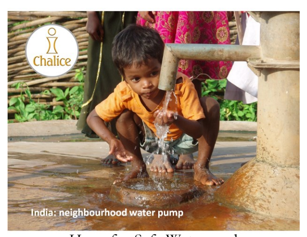
Hope for Safe Water card