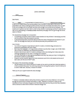
Letters to Parents