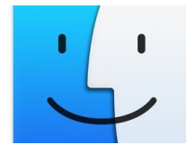
Skype with First Hand Story Teller