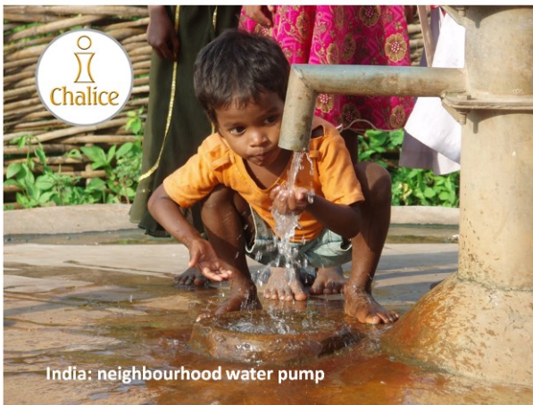
India: neighbourhood water pump