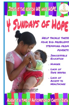
Promotional Posters for the Classroom