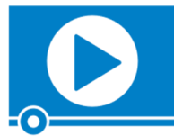
Campaign Introduction Video

Activity Sheets on USB: Colouring Pages, Legend of the Poinsettia, and Crossword Puzzle