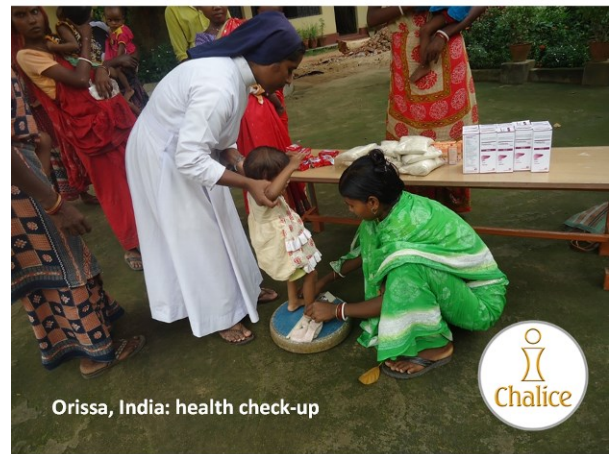
Orissa, India: health check-up