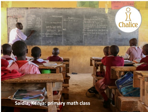
Saidia, Kenya: primary math class

Advent is the beginning of the new liturgical year as well as a new spiritual anticipation and preparation for the birth of Jesus Christ - God's promise of salvation has arrived. Jesus is the reason to have hope for salvation.